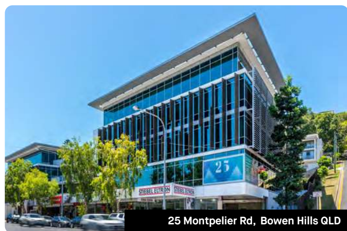
25 Montpelier Rd, Bowen Hills QLD