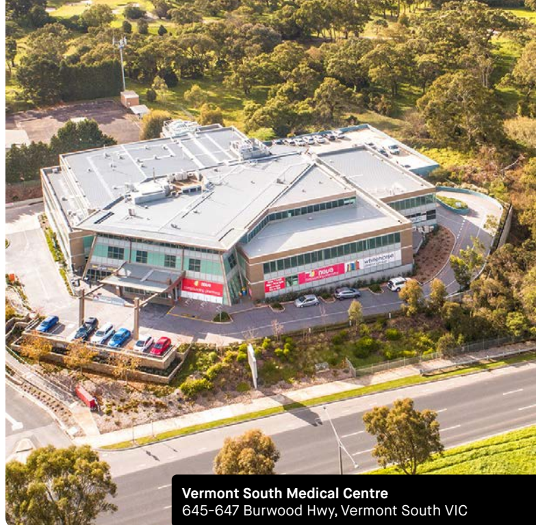
Vermont South Medical Centre 645-647 Burwood Hwy, Vermont South VIC

(5) Carina Heights and Murrumba Village Medical Centre are excluded from Pipeline until an anchor tenant is secured for both properties.