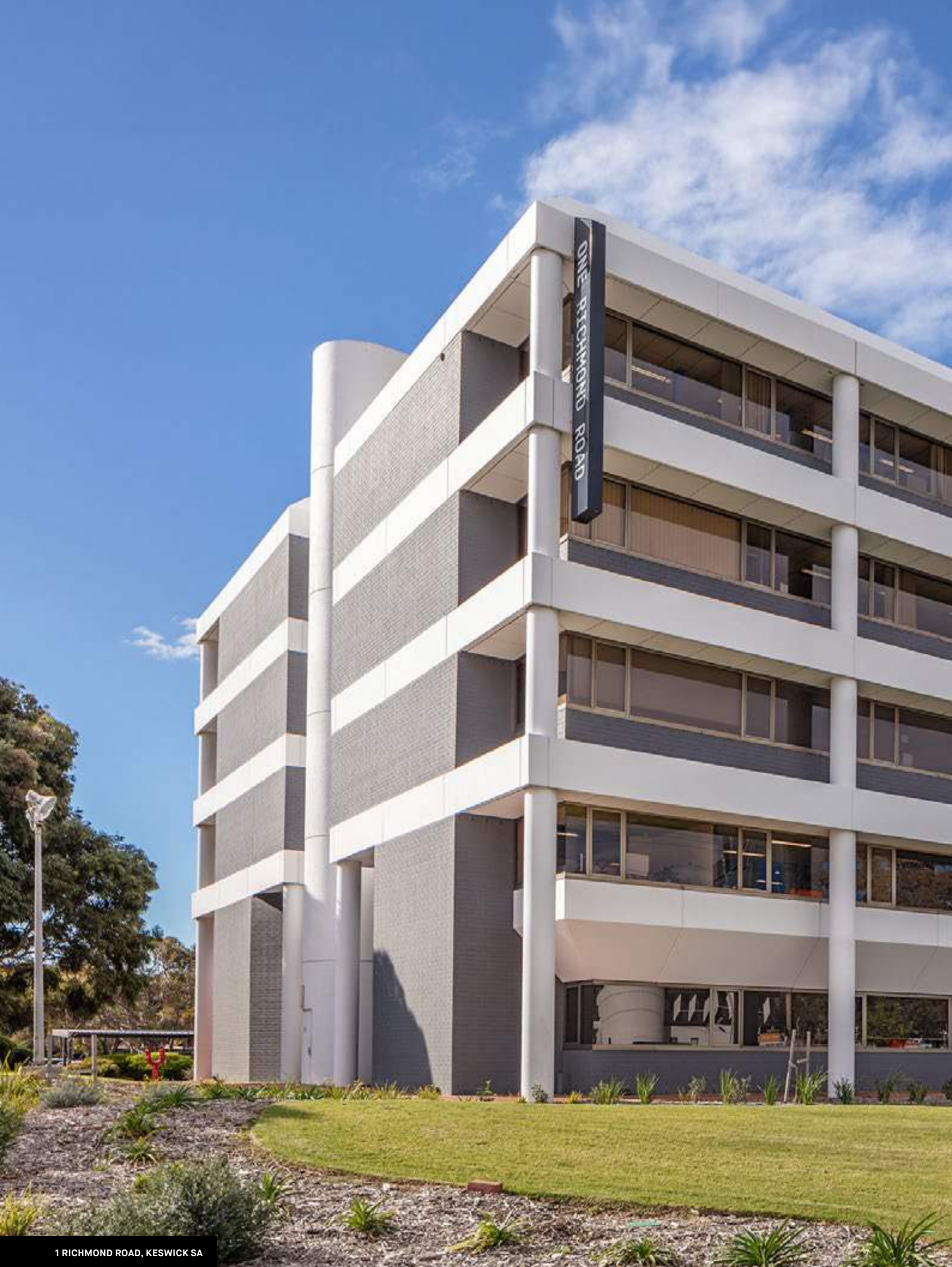
1 RICHMOND ROAD, KESWICK SA