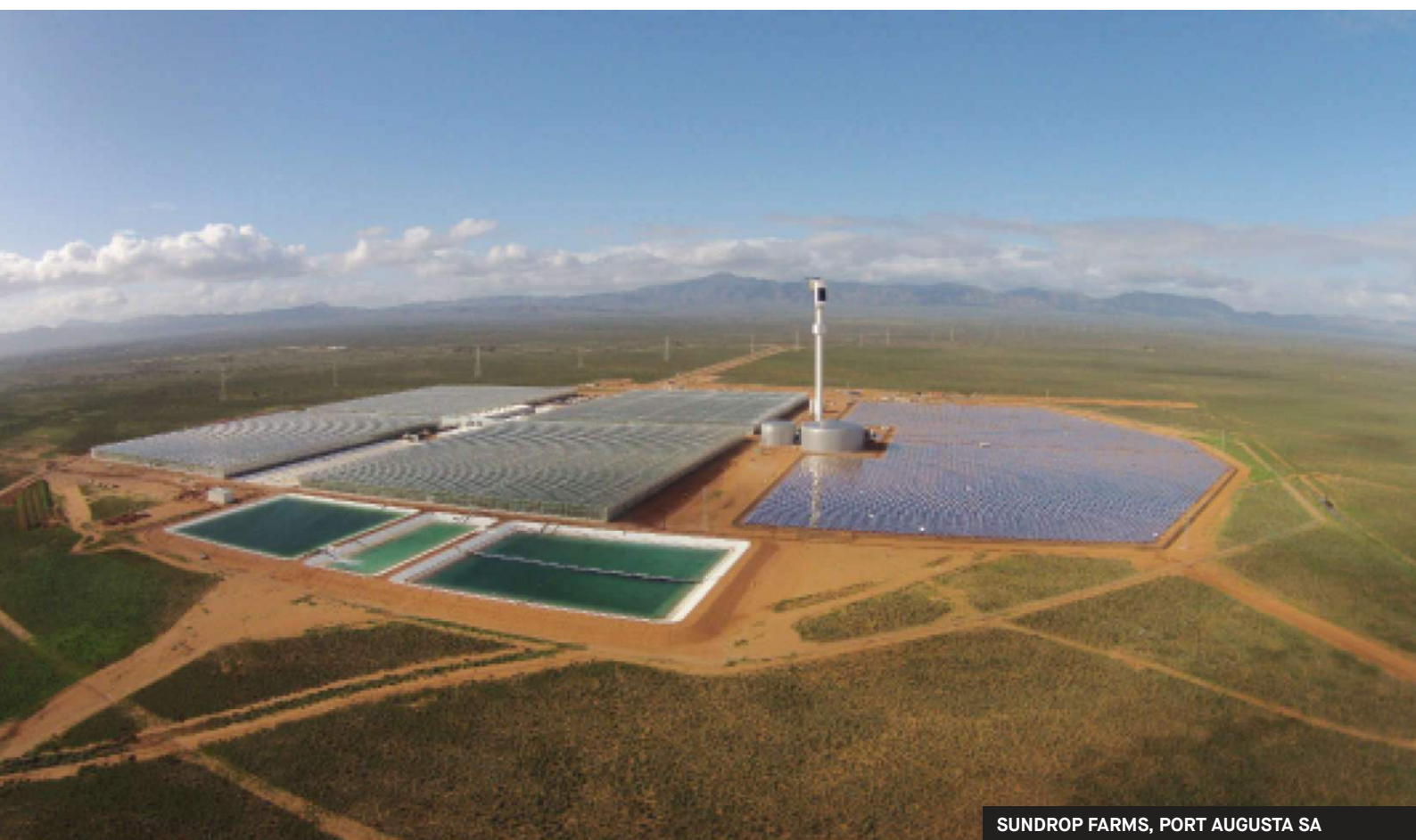
SUNDROP FARMS, PORT AUGUSTA SA

Centuria Property Funds Limited +61 2 8923 8923 | centuria.com.au | contactus@centuria.com.au ABN 11 086 553 639 | AFSL 231149