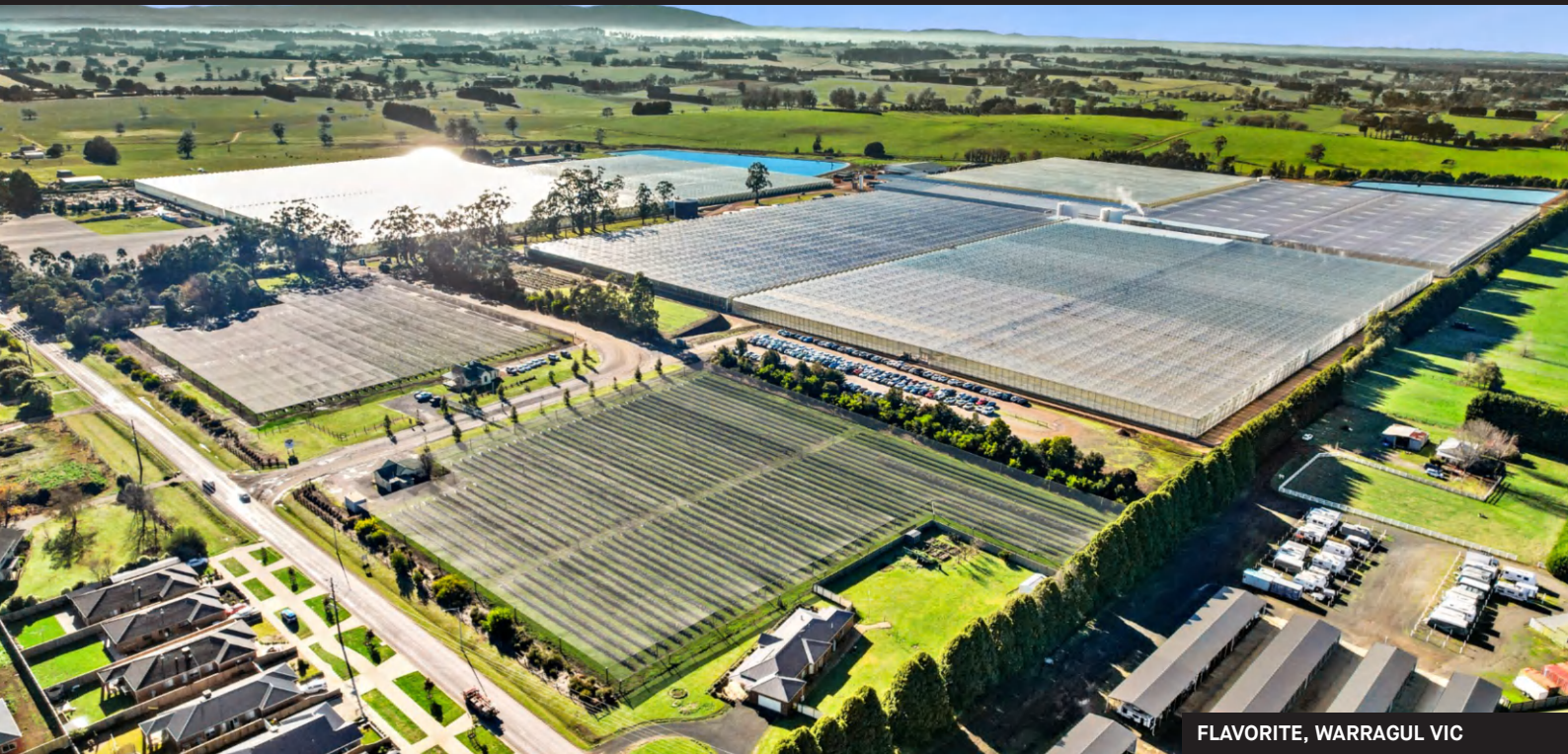
FLAVORITE, WARRAGUL VIC

The Centuria Agriculture Fund 4 (CAF, Fund) is an open-ended unlisted property fund that aims to provide Investors with stable income returns and the potential for capital growth by investing in a diversified agricultural property portfolio.