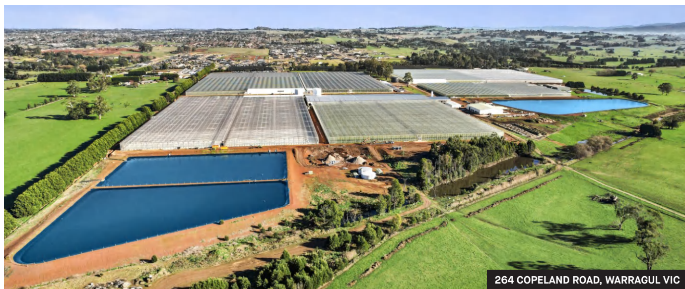
264 COPELAND ROAD, WARRAGUL VIC