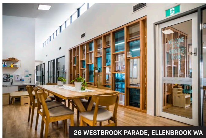
26 WESTBROOK PARADE, ELLENBROOK WA