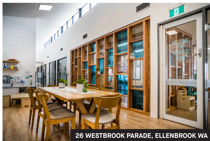
26 WESTBROOK PARADE, ELLENBROOK WA